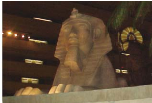
'The Black Pyramid as seen from the towers, The Sphinx keeps his secrets.

The following pic was taken of us when we visited some dear friends: