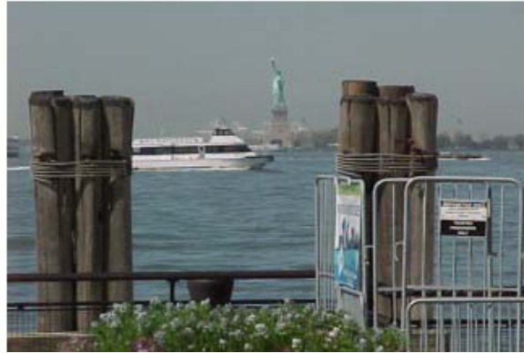
Along Central Park West ... View of Lady Liberty

The motel room was 'rustic' at best, but it was close to the museums and the subway. I didn't get to see everything at the Museum of Natural History, but I did see the dinosaur skeletons and the huge meteorites.