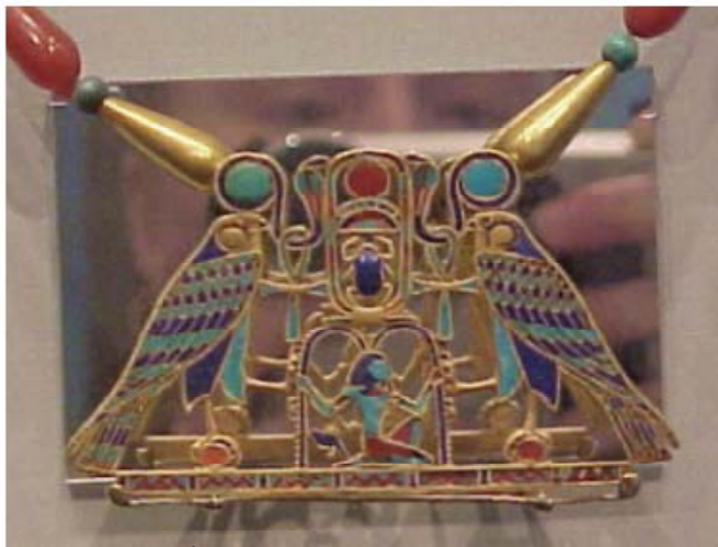
Guggenheim enhanced by Daniel Buren, 12 th Dynasty cloisonné pectoral