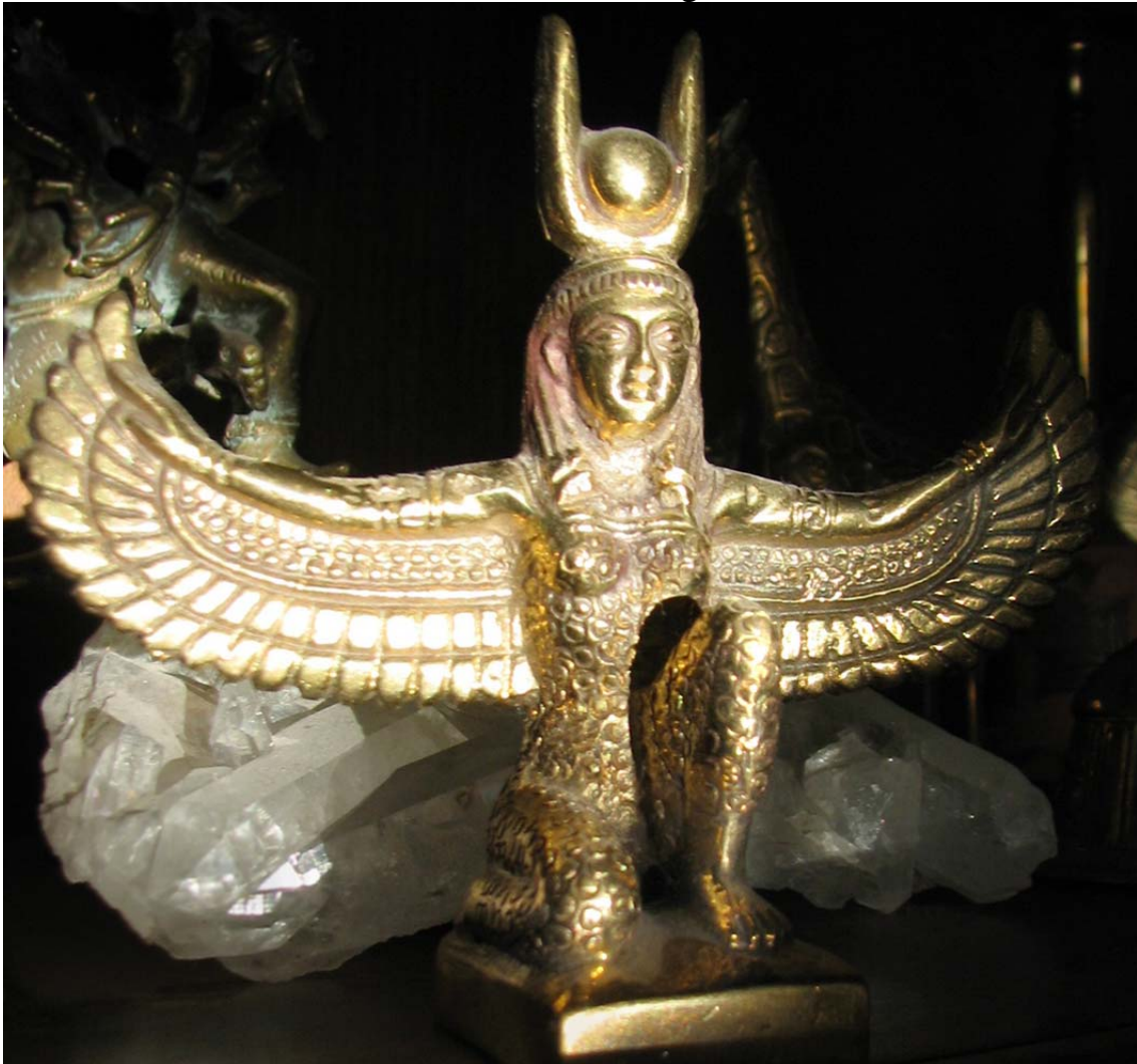
My Isis statue by 'JBL'...

Isis didn't have an ancient city of origination, she wasn't even attested until the 5th dynasty. But she went from these obscure origins to being the most famous goddess: "Evidence of veneration of the goddess has been found as far apart as Iraq and England, with temples being built to Isis in Athens and other Greek cities and later in many parts of the Roman Empire as well as in Rome itself. The cult of Isis rivalled those of the traditional Greek and Roman gods, and its importance and persistence is seen in the fact that her worship continued at Philae until the 6th century AD - long after most of Egypt and the wider Roman world had been converted to Christianity." ( The Complete Gods and Goddesses of Ancient Egypt , by Richard Wilkinson, page 149)